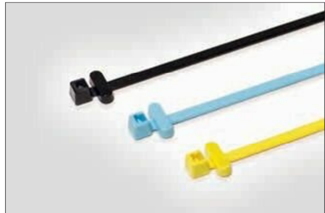
T50RFID – cable ties with RFID transponder.