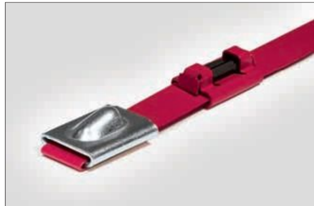
MBTRFID – stainless steel RFID cable ties for product identification in harsh environments.